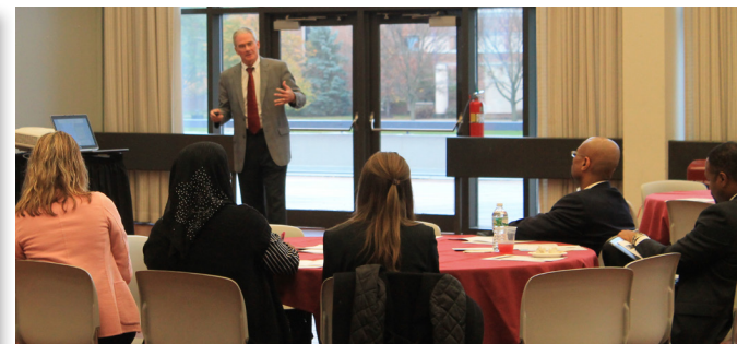
As lead agency of the Greater Mercer Coalition to Prevent Child Sexual Abuse, we provided free community workshops training hundreds of adults how to protect children from sexual abuse.

* Audited results, year ended 12/31/2015