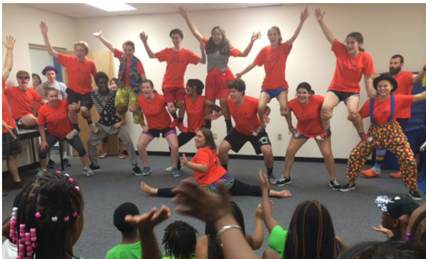
Our Mother/Daughter Support Group enjoyed a circus performance followed by a confidence-building clinic.

Through our intervention services, we provided crisis counseling for child victims of sexual abuse, anger management for at-risk youth, community-based rehabilitation for first-time juvenile offenders, and support services for children in foster care. PEI Kids continued to expand its services, outreach, and community partnerships to meet the needs of Mercer County's children and youth and create an environment where they can grow and thrive.