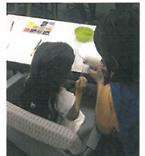
Mother and daughter bond during support group pottery activity at PEI Kids' office.