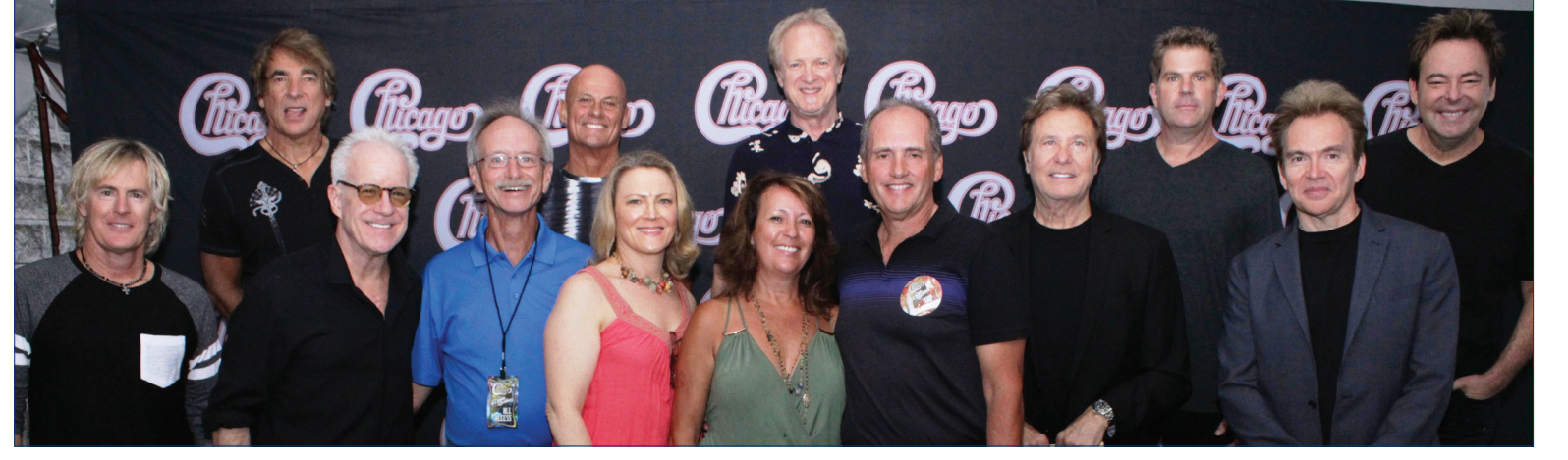
Winners from PEI Kids' Live Auction enjoy an evening with the band, Chicago