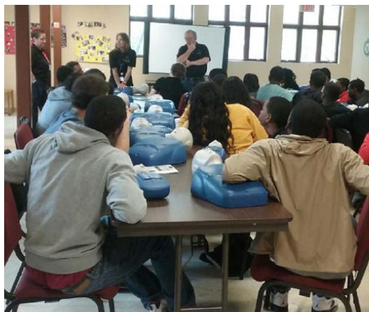
CIOOS participants learn CPR from Capital Health's EMTs.