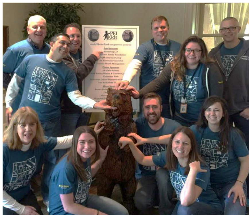
Volunteers from Bloomberg LP help set up for the Dinner & Auction