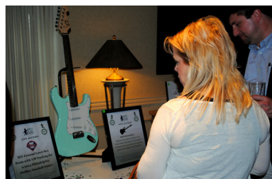
Attendees browse over 80 donated auction items