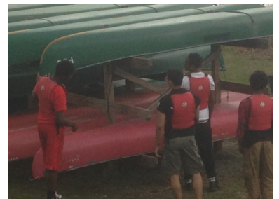
Photo: CJOOS participants prepare for canoeing at Princeton-Blairstown Center

On May 2nd and 3rd, PEI Kids' Comprehensive Juvenile Offender Outreach Services (CJOOS) program took program participants on an overnight camping trip to the Princeton-Blairstown Center. The CJOOS program takes participants on camping trips three times a year, which is key to ensuring success for adolescents in the program by exposing them to a different environment and new experiences. During these camping trips, participants practice teambuilding, learn new skills, and enjoy recreational activities like canoeing.