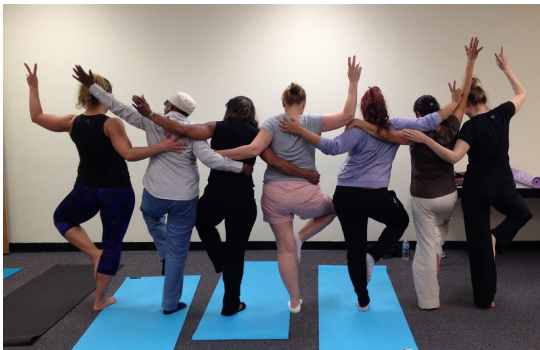
Mother/Daughter Support Group participants enjoy the Body Flow workshop

PEI Kids' Crisis Intervention program provides therapeutic counseling for child victims of sexual abuse as well as other necessary services to support child victims and their families. A core component of the program is the Mother/Daughter Support Group which consists of past and present clients and their mothers and maternal figures. These biweekly support group meetings help members heal, cope, benefit from peer support, and improve the bonds between daughters and their maternal figures, while creating positive new memories through events and activities sponsored by our partners.